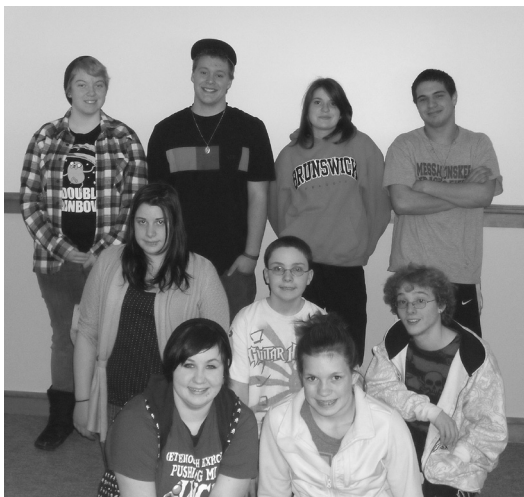
Members of the New Moon Group.

The New Moon Group is a collaborative effort with current clients and graduates of the Wraparound program, which strives to make the program more accessible and easily understood by youths and potential clients.