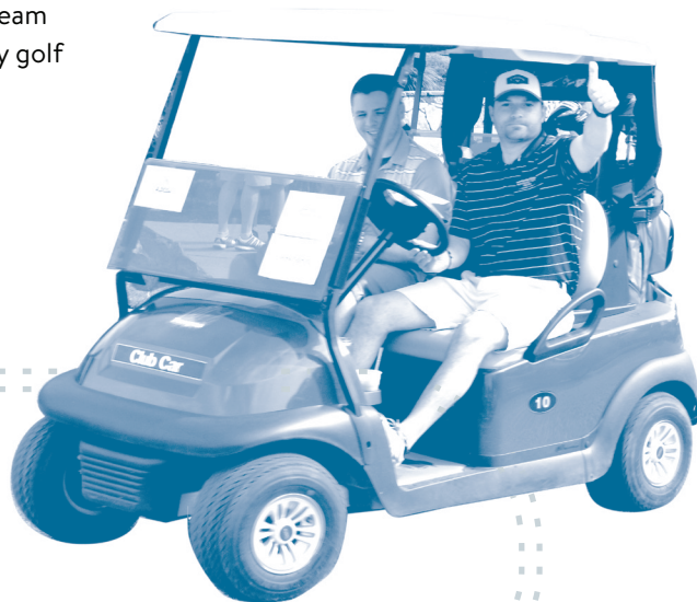
The Prime Motor Group team is ready to play.

clubs that support this tournament. A special thanks to our corporate sponsors: Prime Motor Group, ADESA Boston, Biddeford Savings Bank, Brian Gilbert Associates, Cafua Management/ Dunkin’ Donuts, Casella Waste Systems, Domestiks Cleaning Service, Harvard Pilgrim Health Care, Lincoln Financial Group, P&C Insurance, Patrons Oxford Insurance, PM Construction, Saco & Biddeford Savings, Seacoast Security, Strategic Media, Systems Engineering, and Toyota Financial Services.