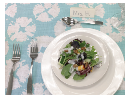
Caption TK dolupta tatae. Ihite cus pro molupta sperferi inum volum et as endent labo lore mod qui dolorepro lorem iest.

Everyone has a seat at the table dining and celebrating what they have learned.